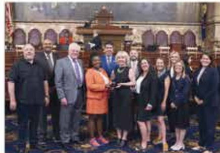
Members of the Wilma Theater in Harrisburg after winning a Tony Award