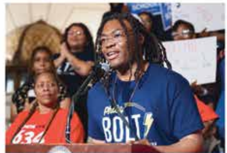
PhillyBOLT student speaking in support of education funding