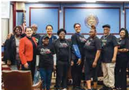
UNITE HERE Local 274 stadium workers meeting with legislators

Representing you means making your voices heard in the halls of power. Over the past few months, Harrisburg has had many visitors from our district! I am so proud that we've been joined in the Capitol building by the Coppin School HOME Band, PhillyBOLT students, and UNITE HERE workers in Locals 634 and 274. These groups visited to advocate for issues including public school funding and fair contracts. YOU are a big reason we have so much to celebrate in the budget!