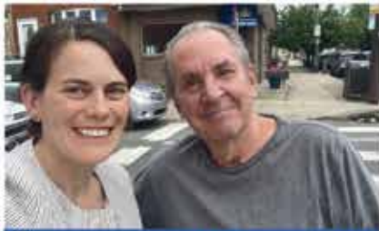
Inside: accessing state services!