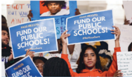
Students rallying for public education funding in Harrisburg